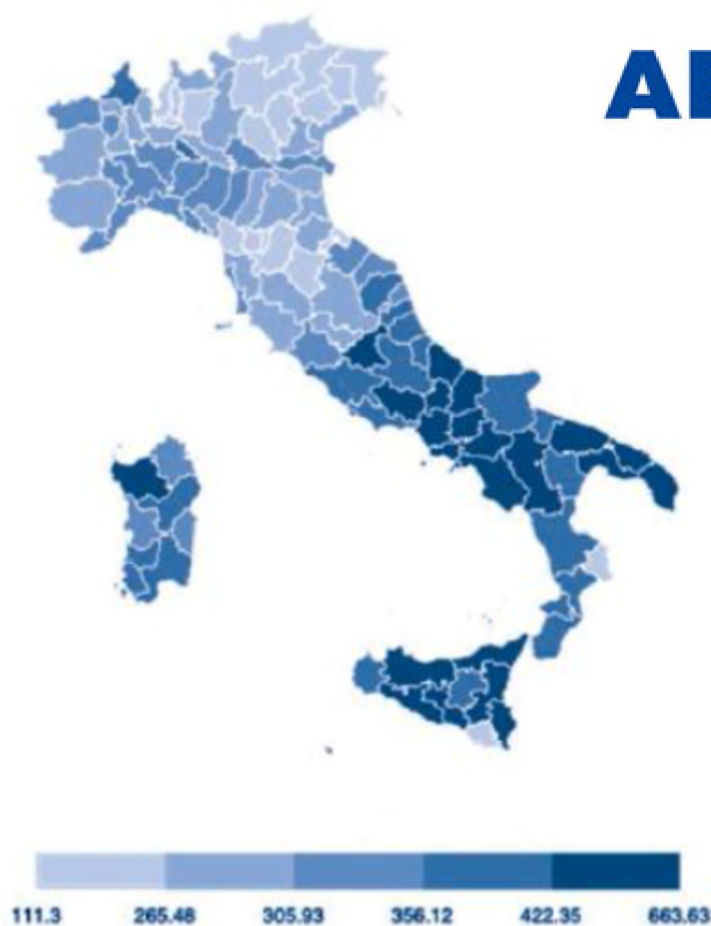
Caesarean section rates in Italy by province, age-standardised, per 1000 women (2011).